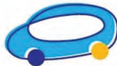
IFAC Technical Committee on Automotive Control, TC 7.1

Regular papers presented at E-COSM'15 will be hosted and freely available online on the IFAC-PapersOnLine.net website and will be citable via an ISSN and a DOI. The best papers will be considered for publication in affiliated IFAC journals. For more information visit e-cosm2015.osu.edu.