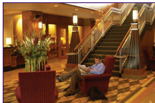
The Blackwell Inn